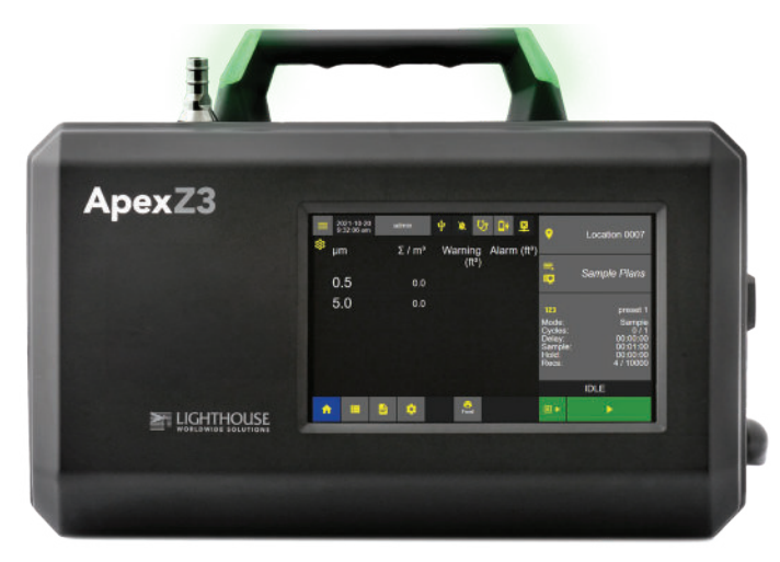
100% digital ApexZ Portable Particle Counter without onboard printer

21CFR11 validations should specifically test these issues and the use of SOPs and providing training to users on the accountability effect. Inactivation logout times should be introduced into the Particle Counter.