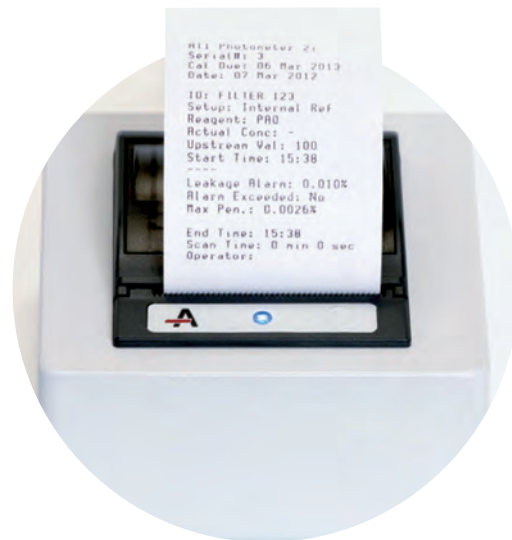
Optional Printer & Sample Report

Three unique report functions are now available with the 2i through the USB or optional thermal printer interface. Continuous mode offers the same output as ATI's legacy photometers to ensure backward compatibility. Monitoring mode provides the ability to collect data at user defined intervals for long term sampling. Summary mode, which gives discrete reporting capability for individual filter locations, can output to the thermal printer to meet customer documentation requirements.