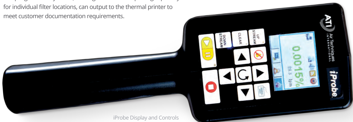
iProbe Display and Controls